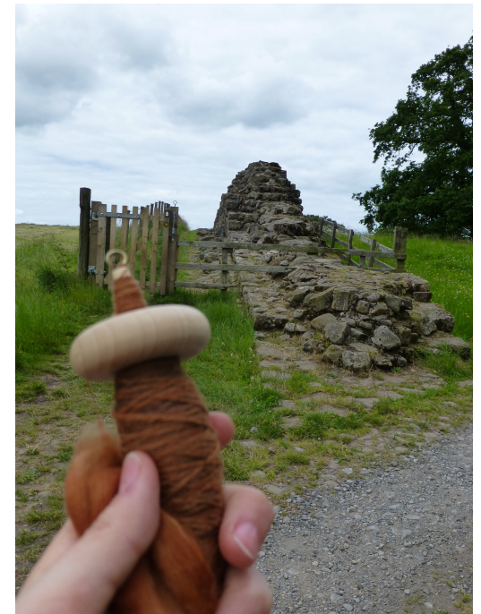
Walking Hadrian's Wall, England, June 2014