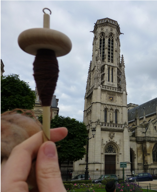
Waiting for the Tour de France, July, 2014