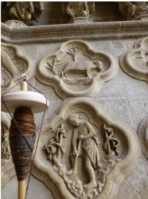
Outside a French cathedral, July, 2014